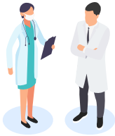
UROLOGISTS AND CONTINENCE SPECIALISTS

Occupational therapists can help to provide advice and equipment to help you get around safely, including where you can install equipment to help you at home.